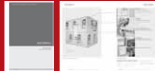
Step By Step Guide