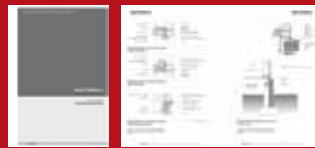
Installation & Construction Details

All of these booklets are available online at: